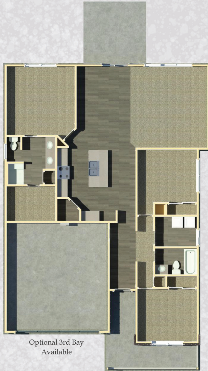
Optional 3rd Bay Available